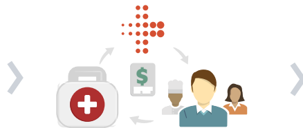
Both Provider and AblePay Promote Service to Patients, Employers and the Community