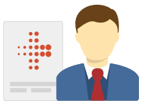
AblePay Contracts with Provider